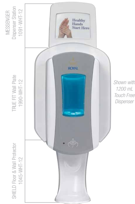
Shown with 1200 mL Touch Free Dispenser